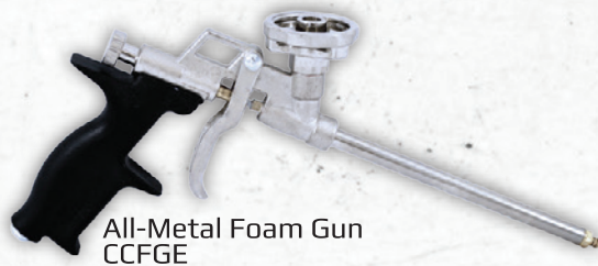
All-Metal Foam Gun CCFGE

The All-Metal foam gun is a professional, reusable gun for the price of a plastic gun.