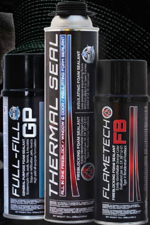
Everkem Diversified Products' Selection of Foam Sealants