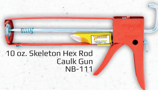
10 oz. Skeleton Hex Rod Caulk Gun NB-111