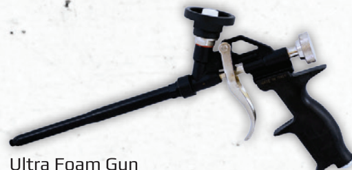
Ultra Foam Gun CCFGU