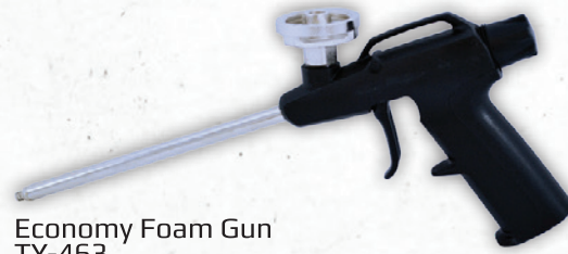
Economy Foam Gun TY-463