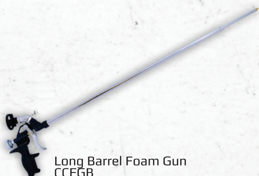
Long Barrel Foam Gun CCFGB

The Long Barrel foam gun facilitates applications in excessively high or low areas (sub floors, insulation, etc.).