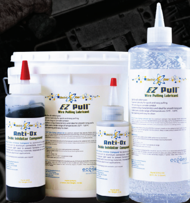
The Electra Kem Line Of Products