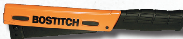
Bostitch H30-6 Hammer Tacker