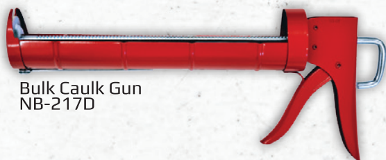
Bulk Caulk Gun NB-217D

Bulk Caulking Gun accomodates quart size cartridges.