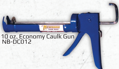
10 oz. Economy Caulk Gun NB-DC012

10 oz. Economy Caulking Gun accomodates 10 ounce cartridges, and is designed to be a cost effective, yet reliable solution for virtually any use or caulking application.