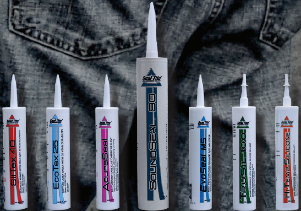
The Seal Tite Line Of High Performance Sealants