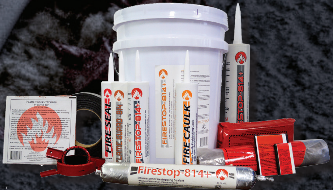
The Flame Tech Line Of Firestopping Products